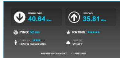
Compression Turned On

http://www.speedtest.net/my-result/4448323639