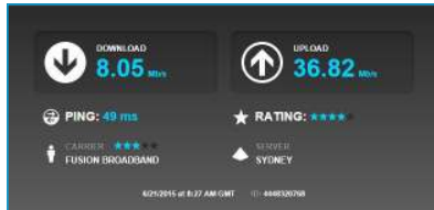
Compression Turned Off

http://www.speedtest.net/my-result/4448320768