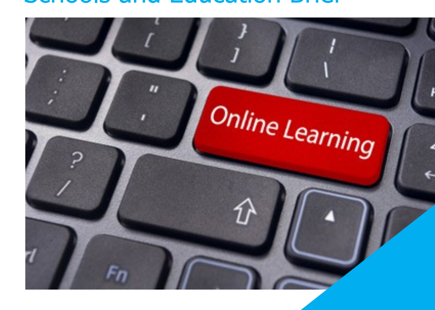
Bonded ADSL Schools and Education Brief